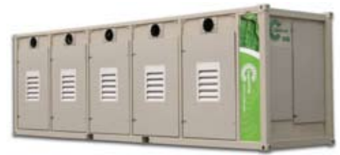
C1000 Power Package